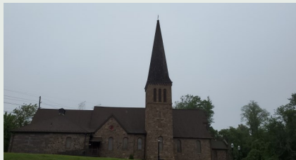
CHRIST CHURCH, South Amboy

For over one hundred fifty years, Christ Church South Amboy has served South Amboy and surrounding towns with our rich worship and warm fellowship. Even in this time of social distancing, we gather in person and online every Sunday. Our Thrift Store has supported families in need for over thirty years. Our Women with Purpose group engages in many kinds of community outreach through its fundraising programs and annual scholarship. Our parish loves to gather and share in fun and fellowship. A gift to Christ Church South Amboy supports rich worship and relationship which equip our members to love and serve others in Jesus' name!