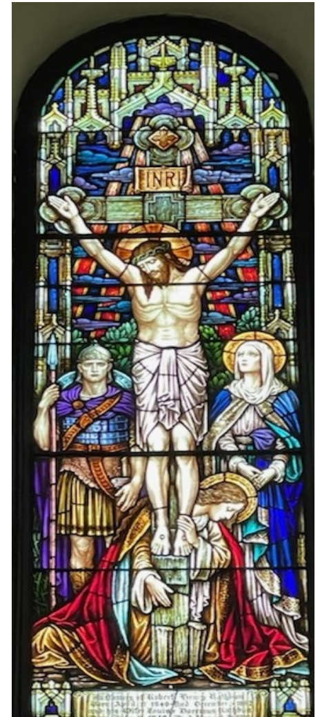
CHRIST CHURCH, South Amboy

Church Address: 220 Main Street. South Amboy, NJ 08879